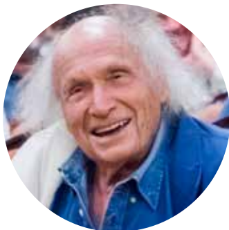
IN MEMORIAM Ivry Gitlis, violin