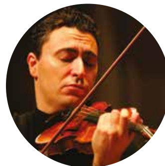
Maxim Vengerov, violin