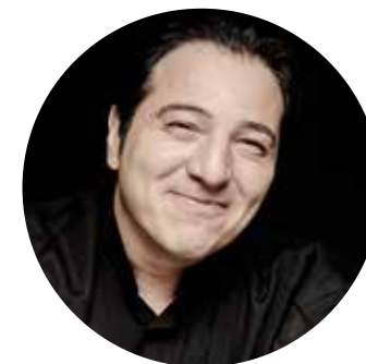
Fazil Say, piano